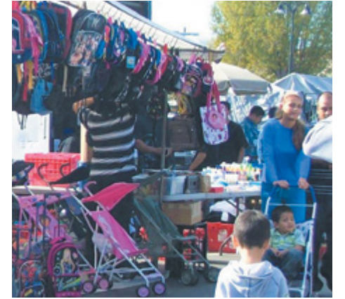
The community has relied on the Marketplace for wonderful things to purchase.