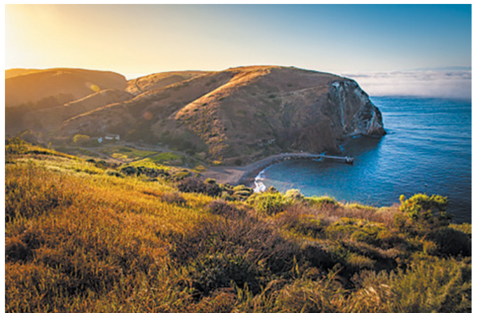
Scorpion offers a beautiful backdrop for picnics, hiking or camping.

PROPERTY ON MARS. PERFECT LOCATION FOR A GAS STATION. TITLE CAN BE PICKED UP IN VENTURA. CONTACT LETSTALK@GMAIL.COM