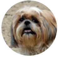
Dedicated to Scamp

On March 1, the Food and Drug Administration (FDA) announced that pet food manufacturer Vitakraft Sun Seed, Inc. had recalled one of its pet foods due to potential Salmonella contamination. The pet food you have in your cabinet could be putting your furry friend's health—or yours—in harm's way.