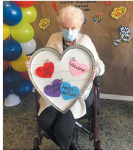
The community now has more than 90% of residents vaccinated.