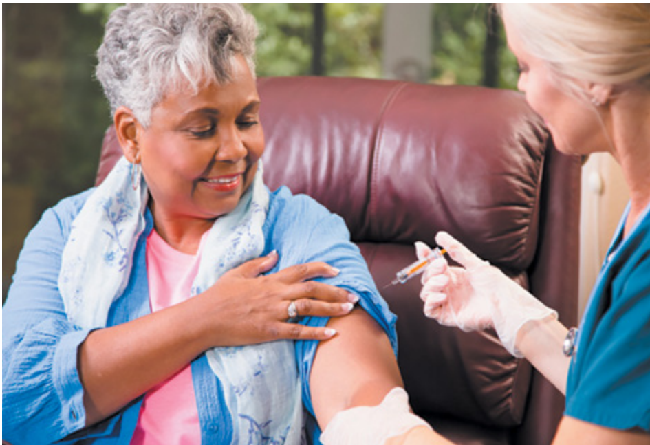
"I hardly even felt this!"