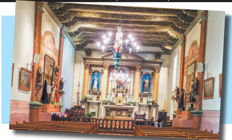
The lighting project was envisioned five years ago.