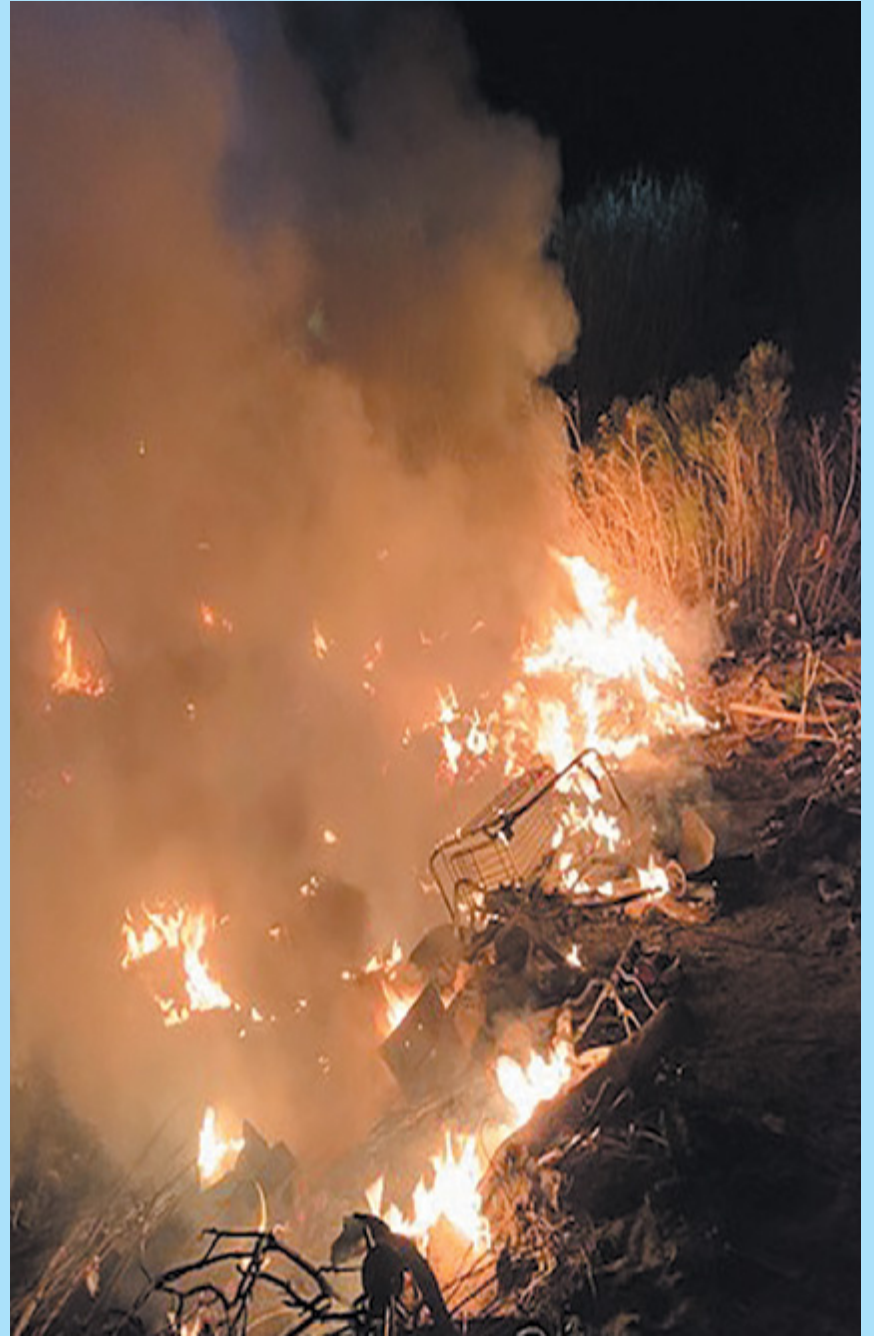
On March 9 at 12am, the Ventura County Fire Communication Center received multiple reports of a vegetation fire in the area of River Haven. A fire response was dispatched to the area and the first fire resource on scene reported a 100'x100' spot fire in heavy vegetation approximately 600' east of Harbor Blvd. It was determined to be a warming fire that extended into the heavy vegetation surrounding a homeless encampment.